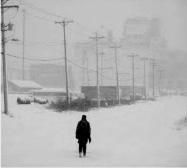
A near white-out: Churchill in a blizzard