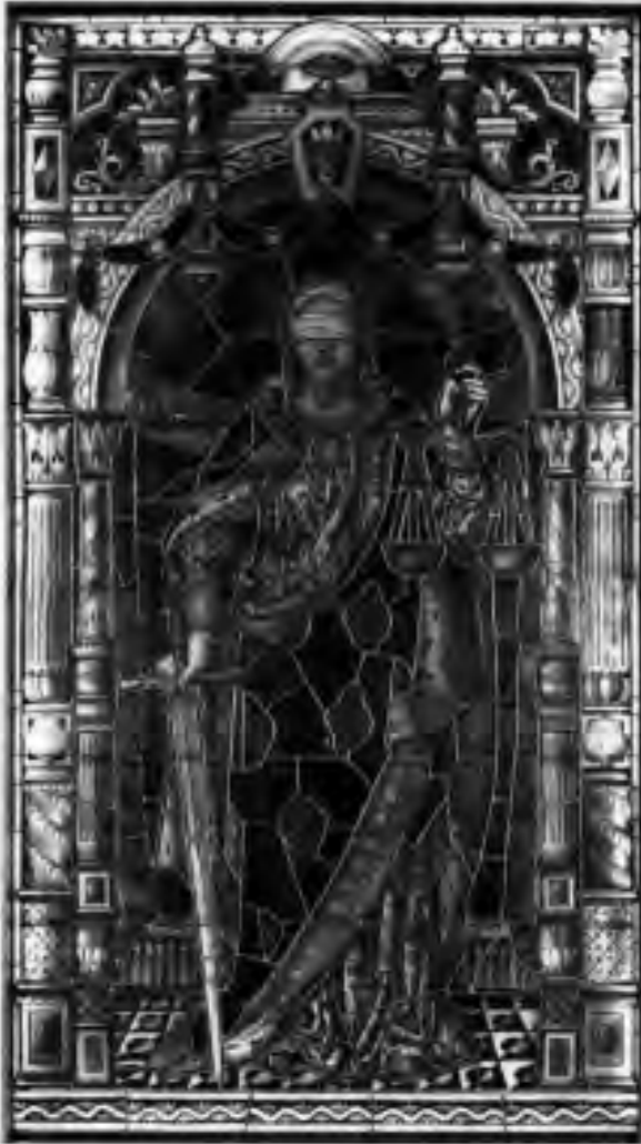
Stained glass depiction of Justice at the Faculty of Law, University of Manitoba

One of them, the short and rotund owner of a grocery store in the North End, playfully pinched their cheeks while saying, “Tell me you won’t do it again, bubbala!”—a loving Yiddish word for a young child. I could almost hear a “fiddler on the roof.”