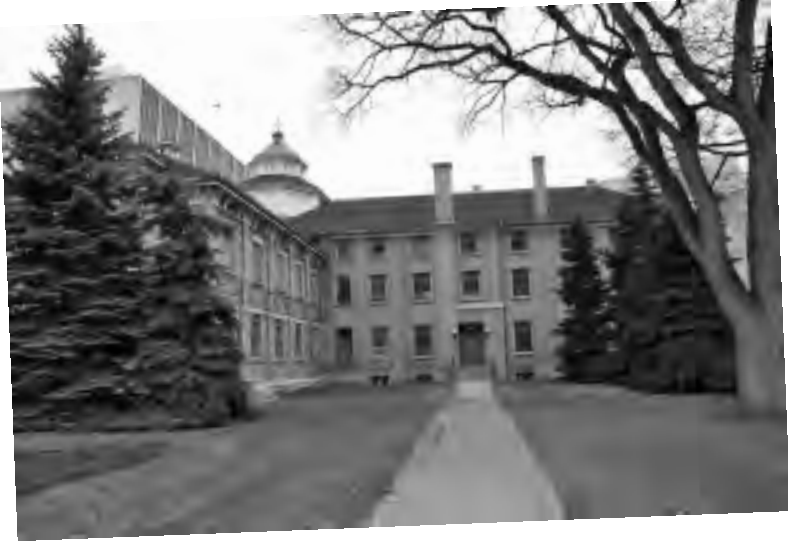
The Winnipeg Detention Centre