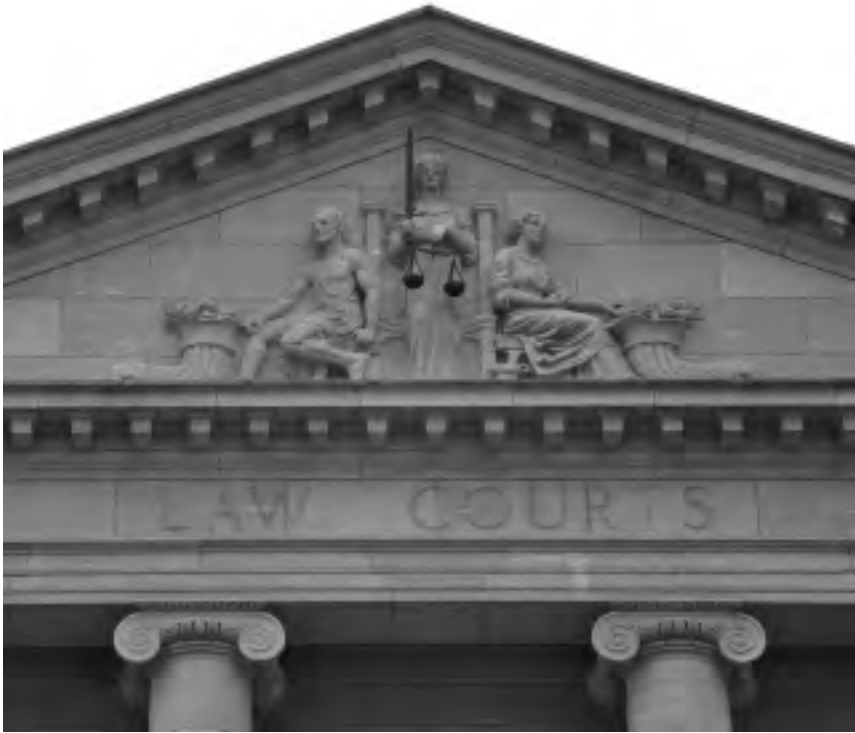
The frieze on Winnipeg's Law Courts Building shows Justice with her sword and unbalanced scales

I did not hear back from the Registrar, and my client did not purchase a PSV licence.