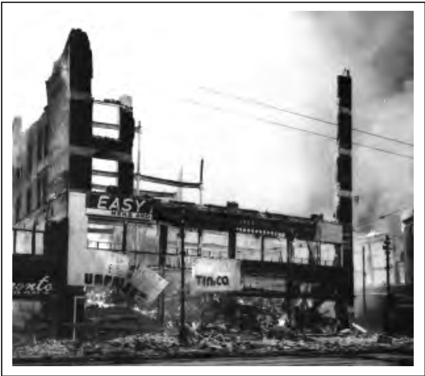
The day after the Time Building fire of June 8, 1954.